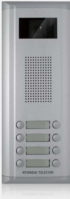
HCC-600 Series Multi Door Camera