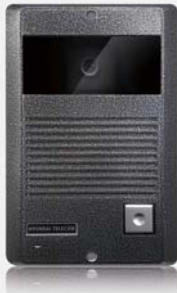
HAC-300 Door Phone Camera