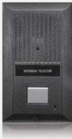
HAC-500 Door Phone Camera