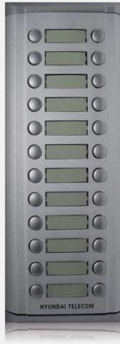
HEP-600 Series Multi Door Camera