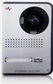
HAC-701 Door Phone Camera